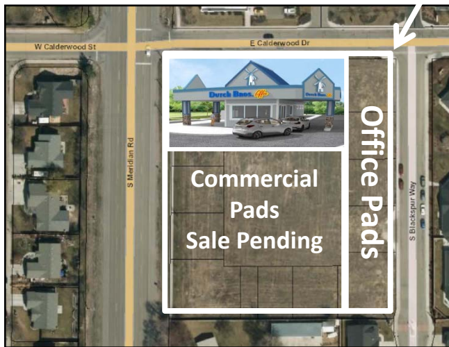
Calderwood Business Park Office Pads Meridian, Idaho

Office Pads for Sale: Pricing on page 2/Plat on page 3.